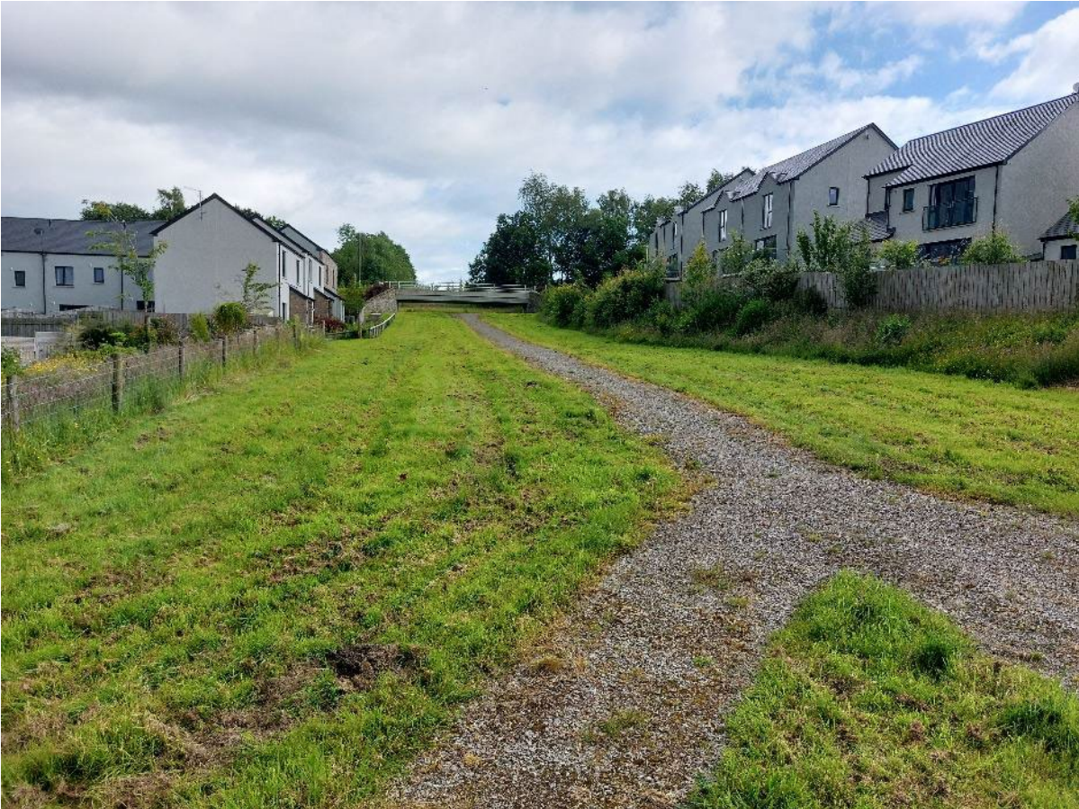
This footpath connects several streets, providing an alternative route with a more rural character. Kirkby Lonsdale.

CODE HP 4.1b Street Design: Street and movement designs must cater to all users, regardless of age, mobility, or gender, ensuring that all potential users can easily access public transport, buildings, and open spaces.