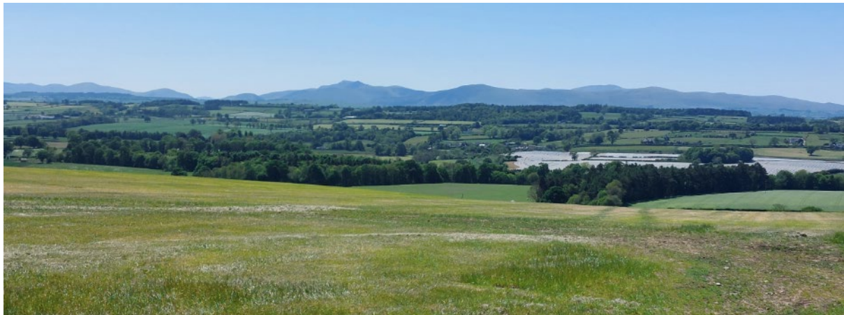
The fairly flat and open floor of the Eden Valley with the hills of the Lake District on the horizon. Aiketgate.