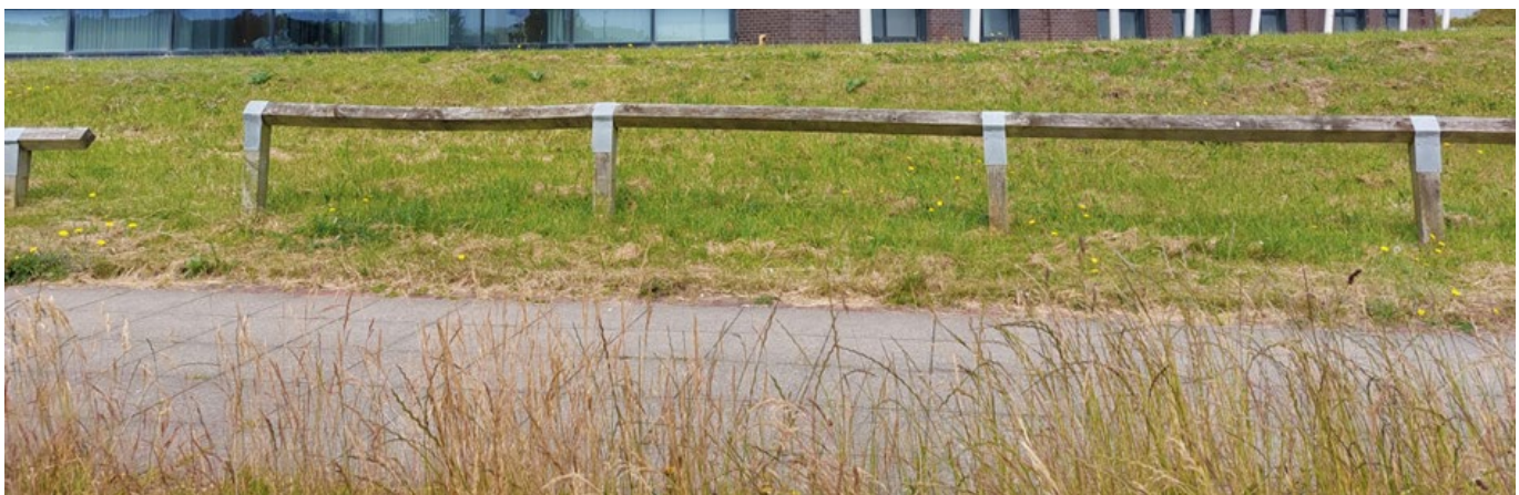
Expanses of lawn can look nice and 'green' on plan, but in practice they offer little amenity, do not encourage biodiversity and are fairly maintenance heavy.