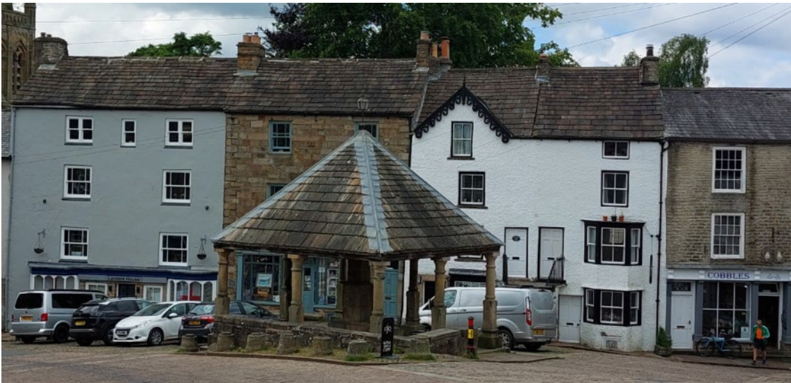
A row of tightly packed buildings of different ages, materials proportions and styles on the narrow building plots lining a marketplace or commercial street. Alston.