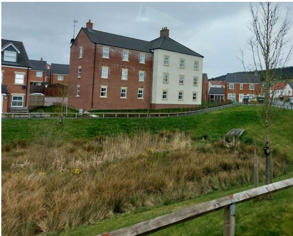
This taller block compared to the surrounding two storey houses acts as a gateway building to the estate and adjoins one of its largest open spaces. In this context the height makes sense in urban design terms. Penrith.