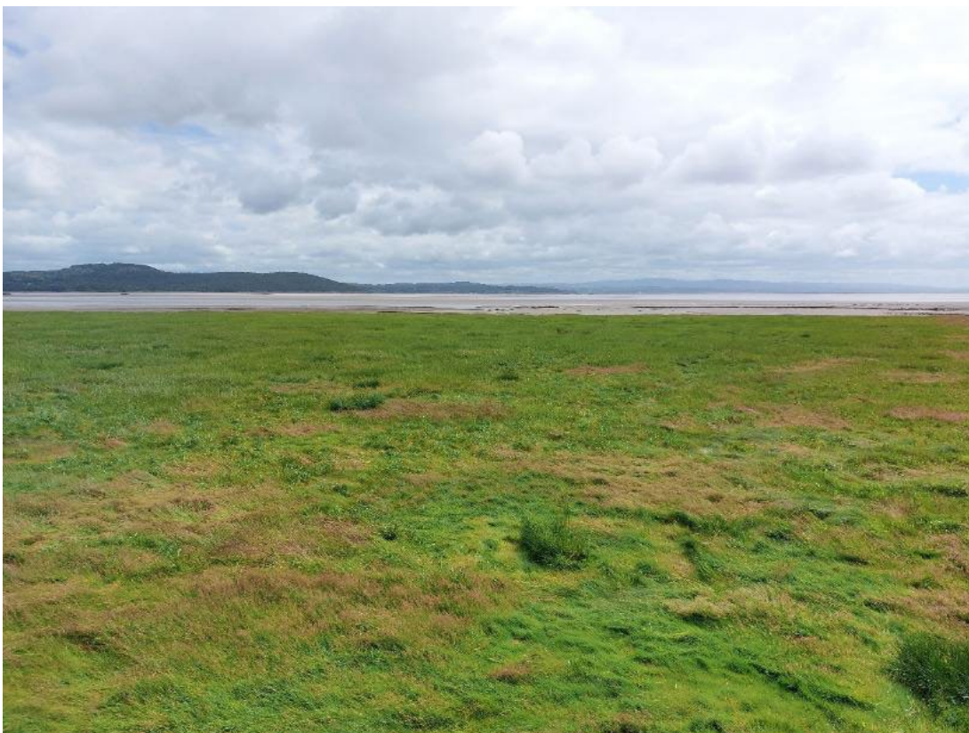
The low-lying flats around Morecambe Bay.