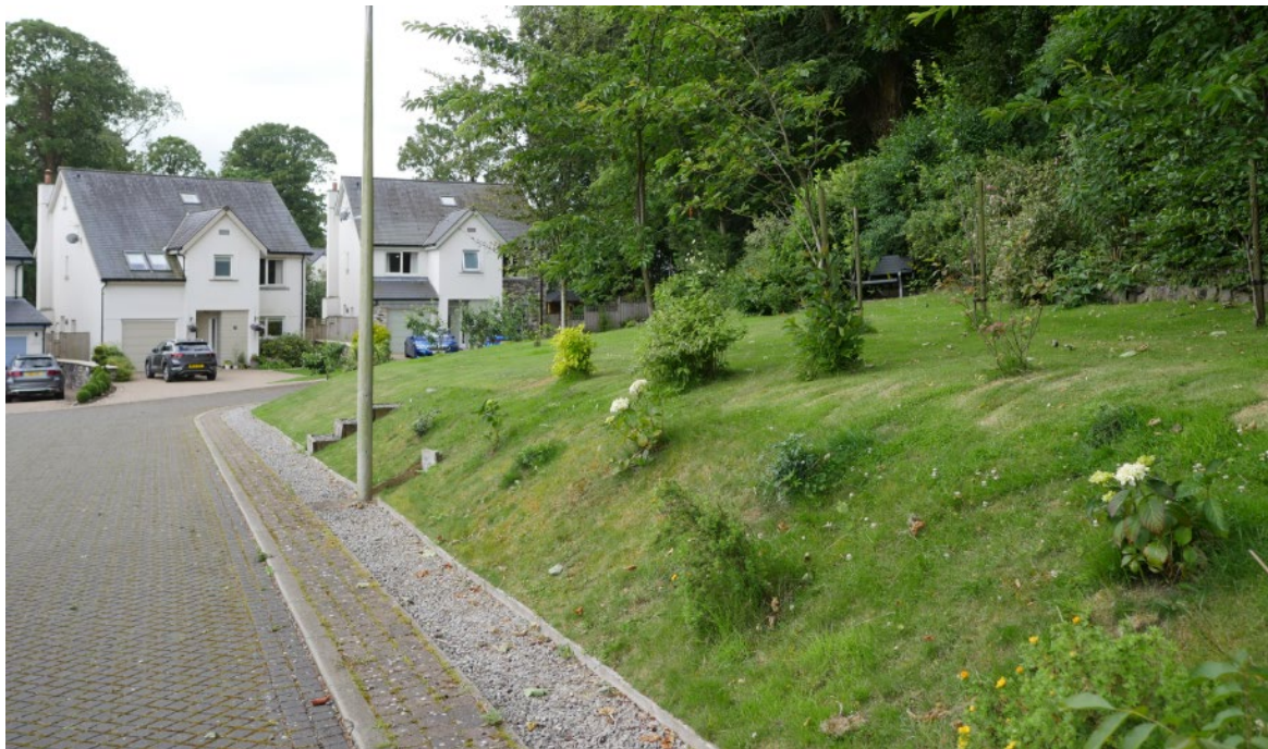
Where the houses are in a lower part of the site, a combination of soft landscaping, a gravel drainage channel and permeable highway surfaces have been used to intercept rainfall and runoff from higher up. Ulverston.