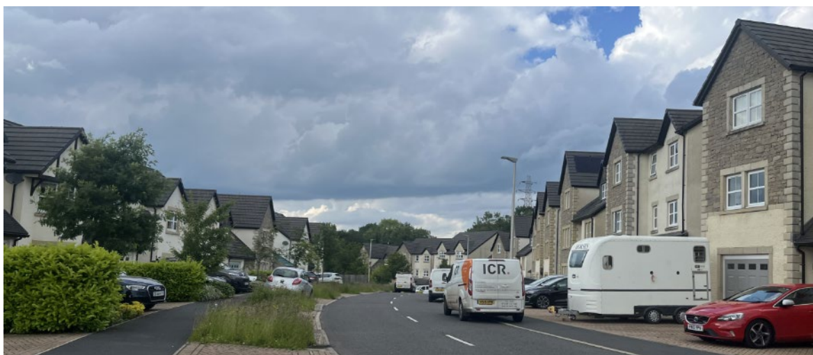
A planted verge offers amenity to the street, as well as providing a destination for runoff from the hard surfaces. Burton-in-Kendal.