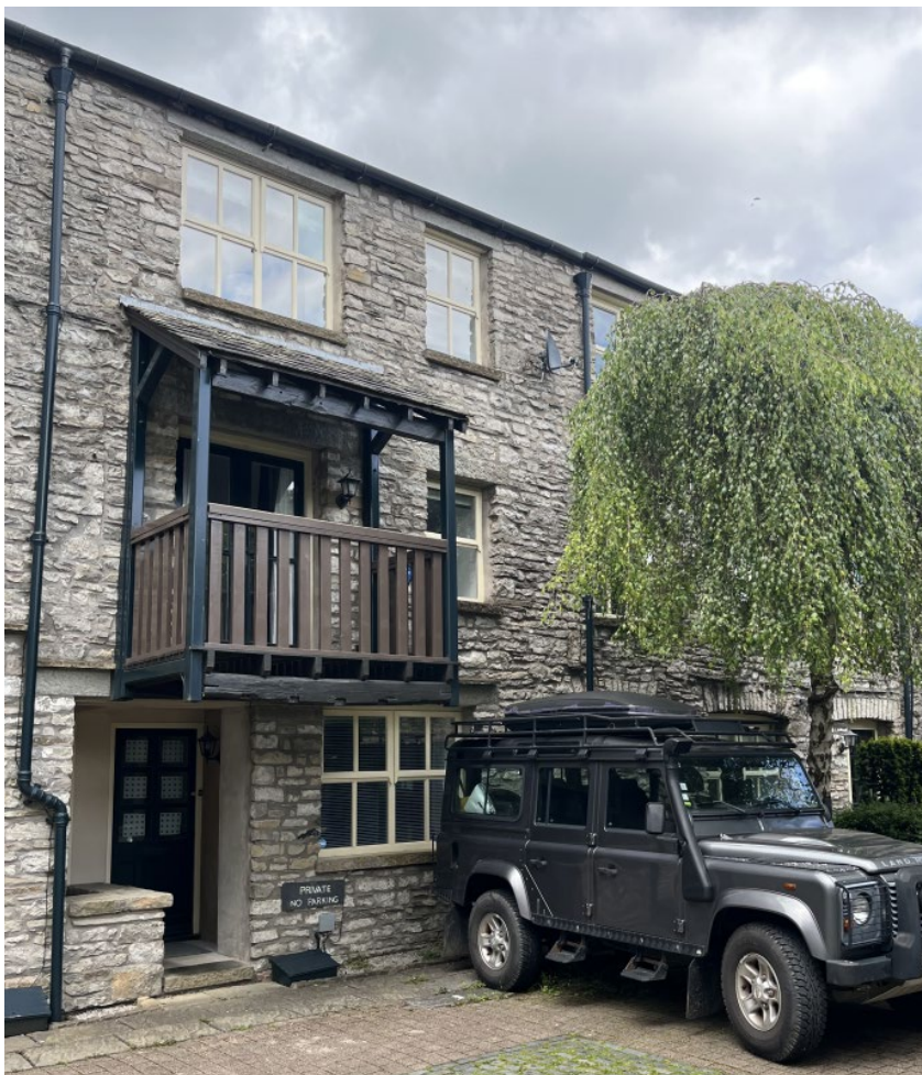
Conversion and adaptation are the lowest carbon solutions. This former industrial building in Kendal is now homes. This makes use of the embodied carbon of the existing building and structure. It could be adapted and re-used in a different way in the future.