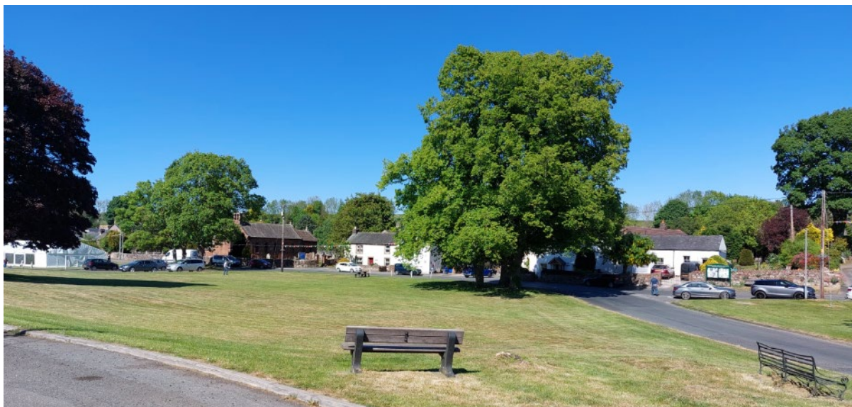
Langwathby village green is a defining space of the village and is its focal point.