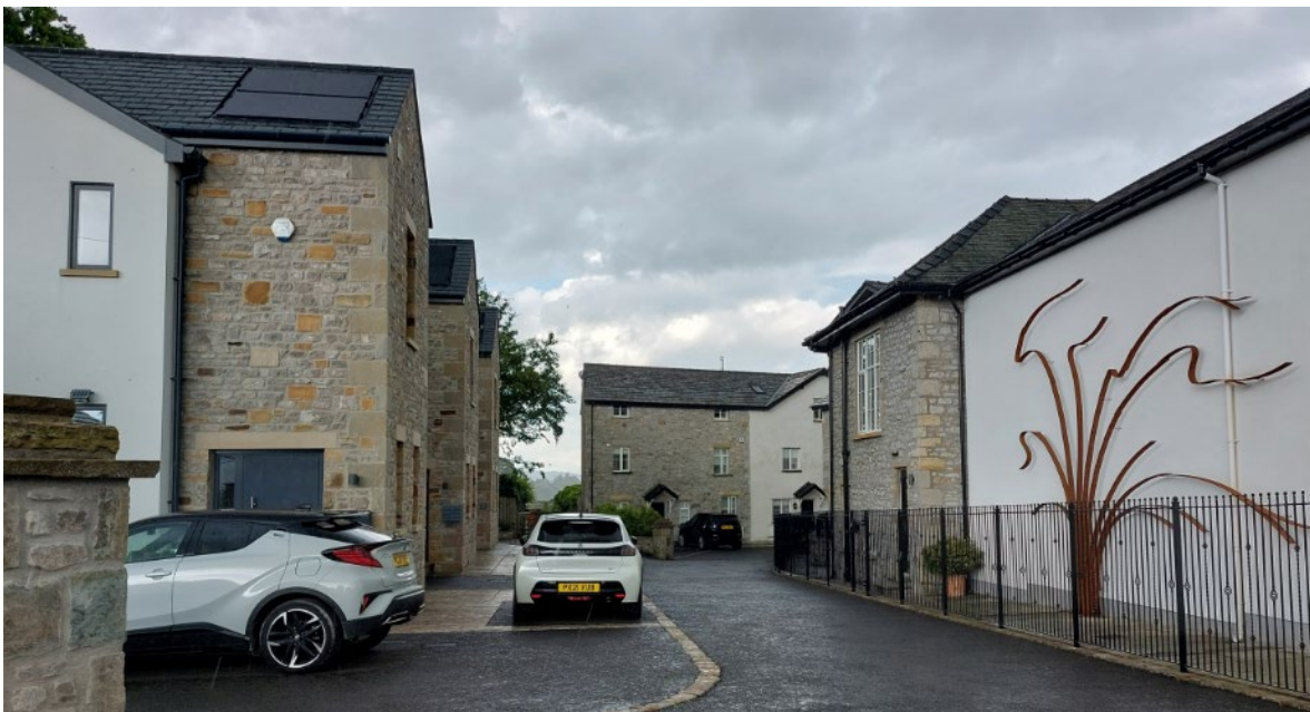
These solar water heaters sit neatly and unobtrusively on these roofs in Kirkby Lonsdale.