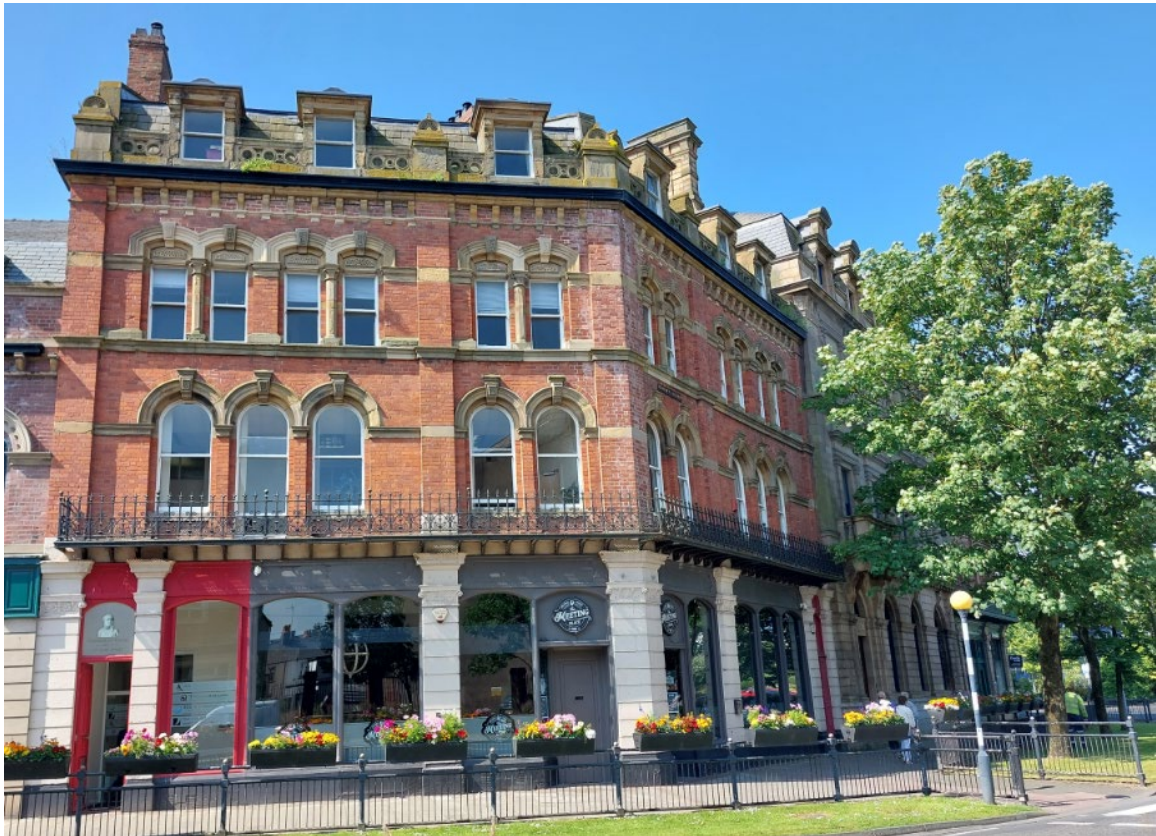
A grand row or crescent of large houses built to a planned layout. Barrow.