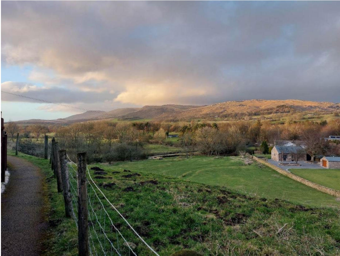
The Pennine upland character around Church Brough.