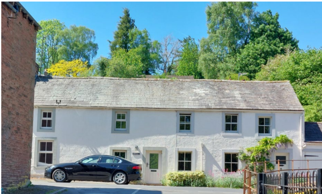
A house facing directly onto the street and having a positive presence in the street scene. Armathwaite.