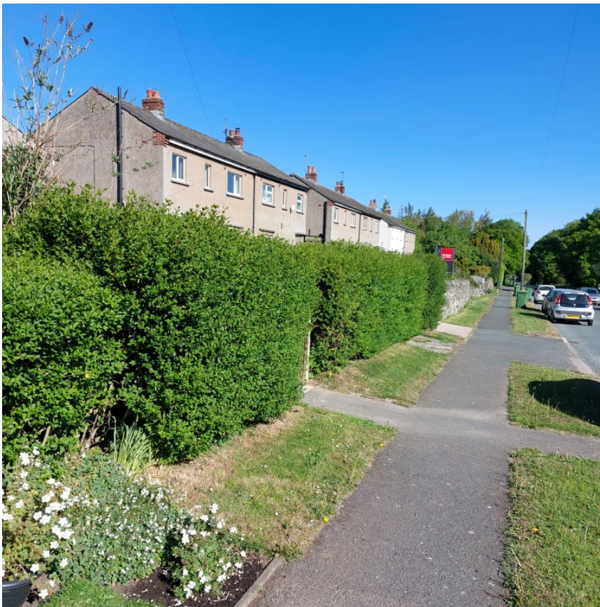
A regular building line of semi-detached houses in Newbiggin. The building line is echoed by the line of the hedges and walls, the verges, pavement and kerb line.