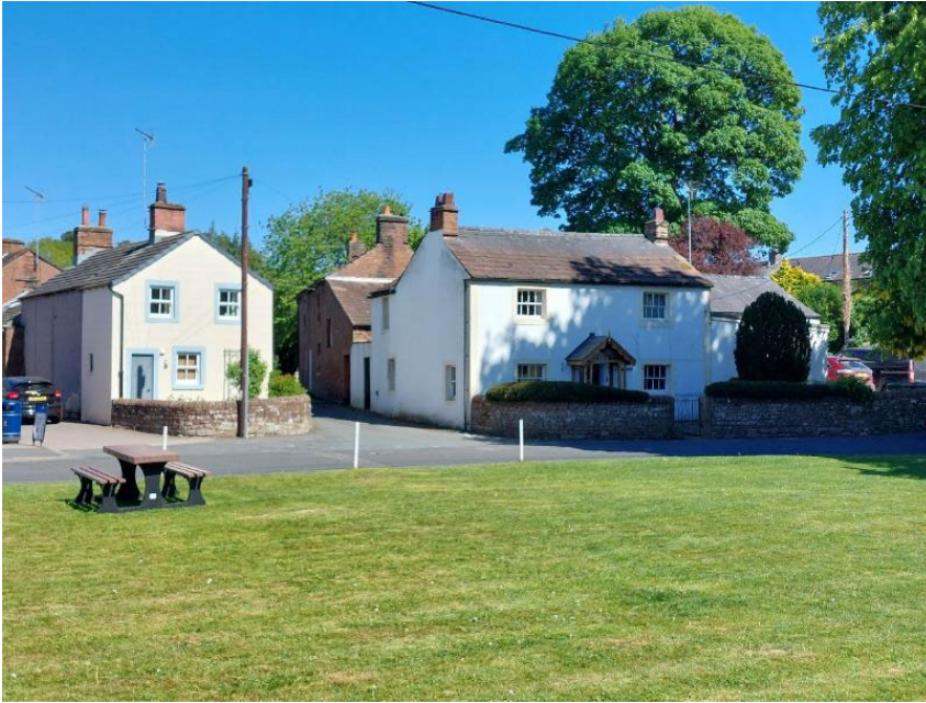
The village green and the routes leading from it have formed a framework for the settlement pattern here at Langwathby. The individual buildings, village green and settlement pattern are each of heritage value.