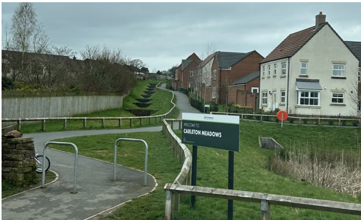
The stepped drainage channel in the centre of the photo becomes a water feature that slows down the flow of runoff in wet weather. It drains into the retention pond in the bottom right-hand corner. Penrith.