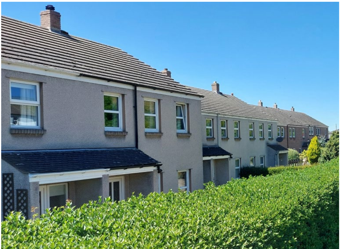
A short row of houses built for social tenants to pattern book designs. Low Hesket.