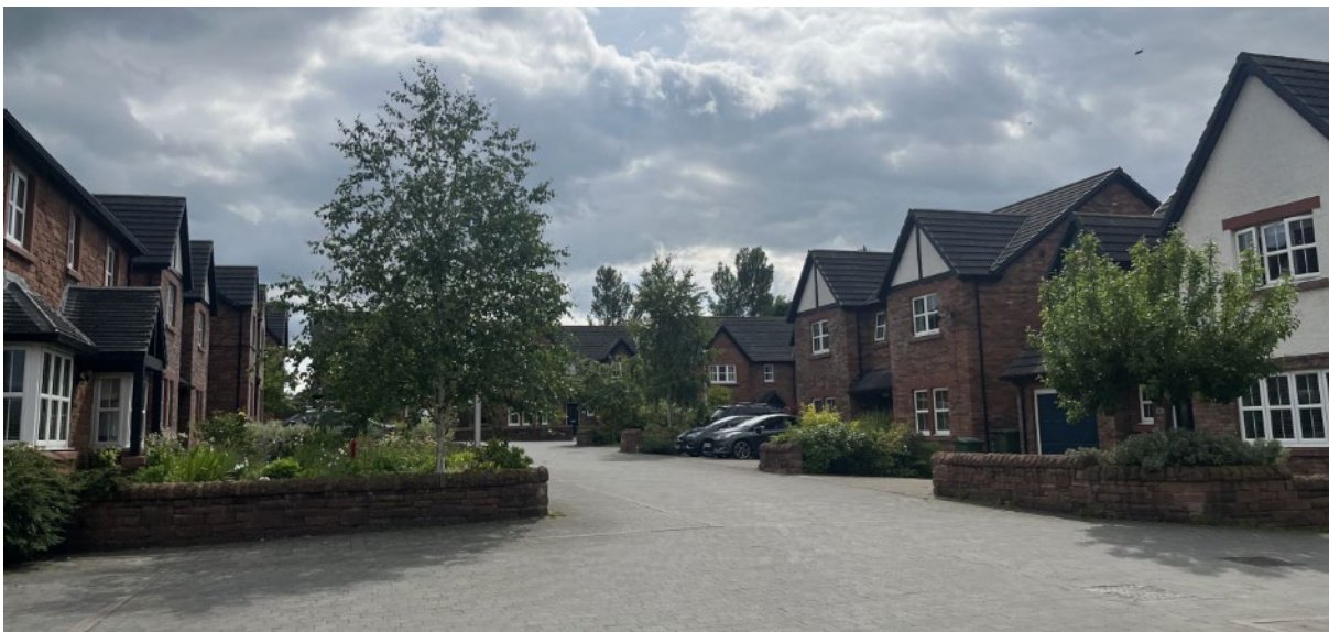
The tree on the left side of the street is on its way to becoming a landmark and focal point in this estate in Lazonby. It is nearly as tall as the buildings and softens the street scene.