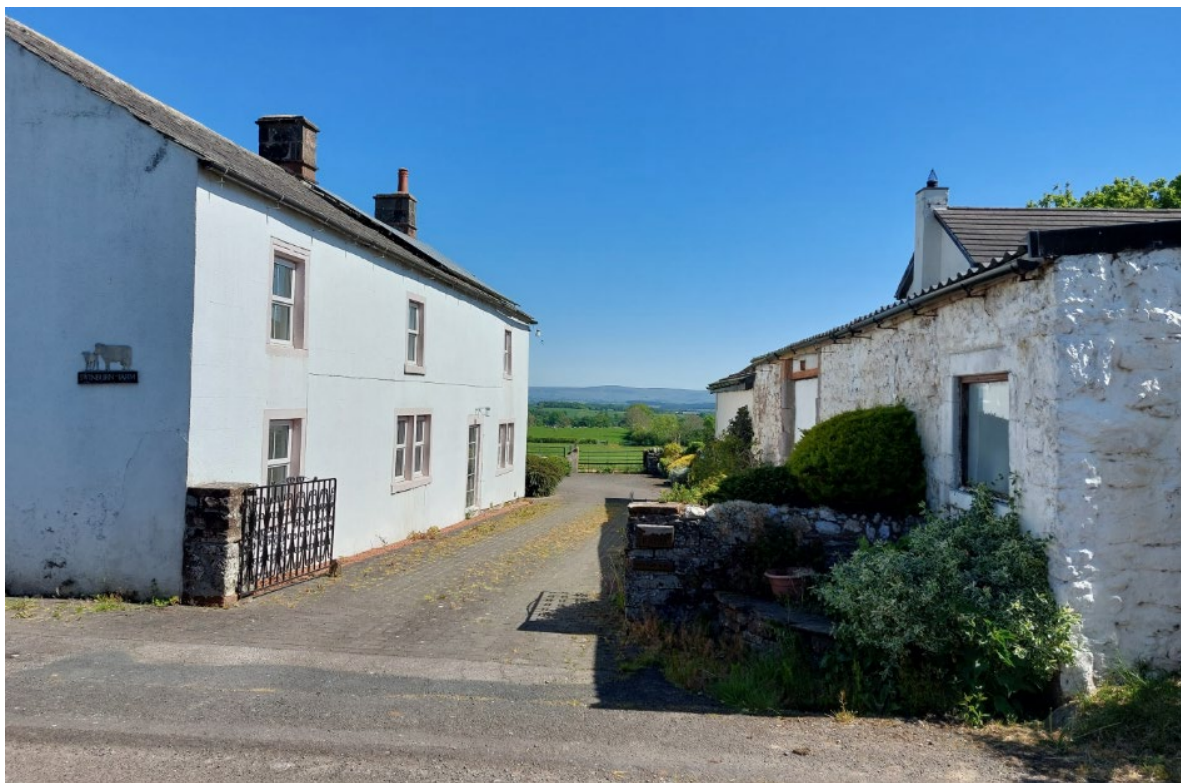
Glimpsed views like this one matter: from the heart of Skelton, there are views across to the other side of the Eden valley. The district is blessed with an interesting and varied landscape.