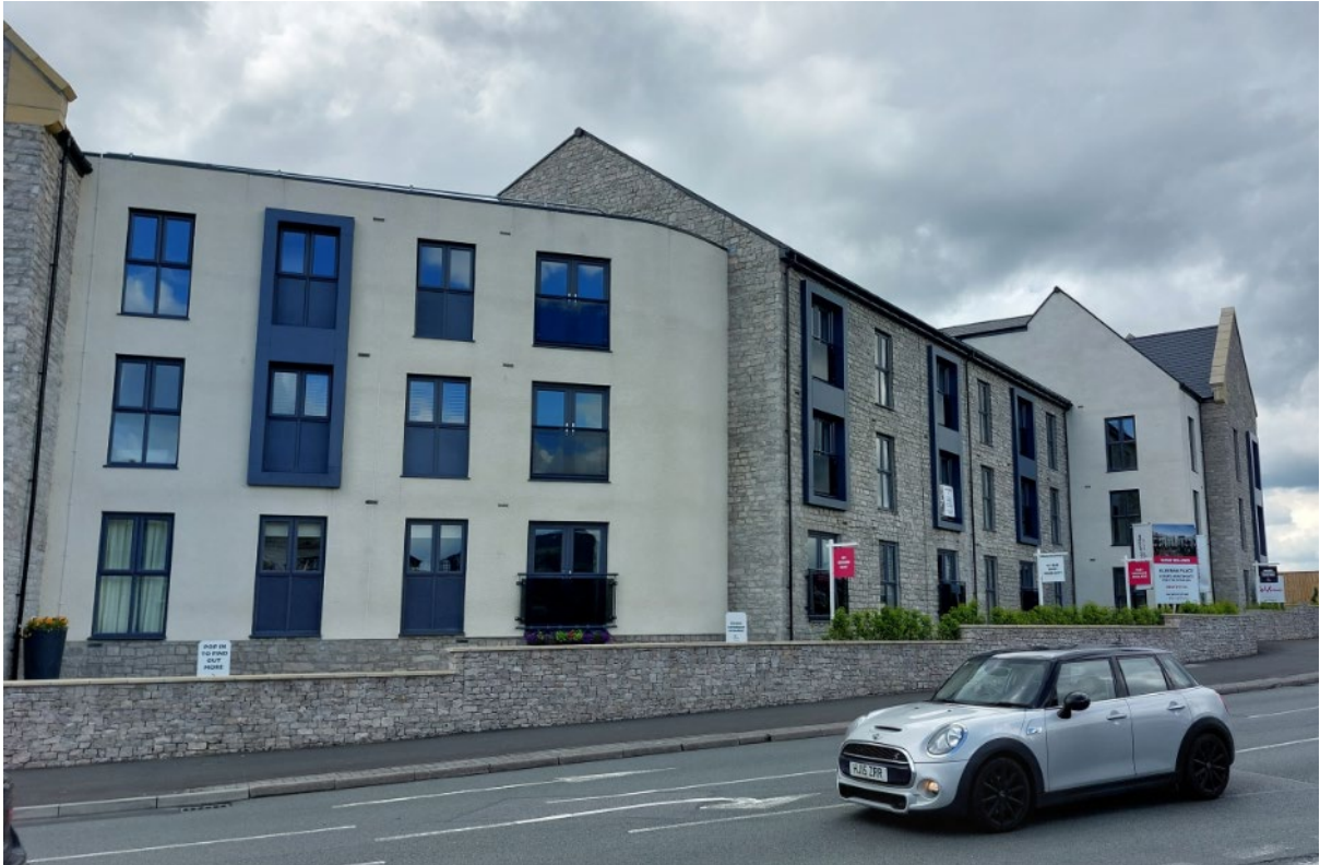
A staggered building line that sweeps around the corner in stages before breaking forward at the far right. This irregular building line helps to break up the mass of a large apartment block in Kendal.