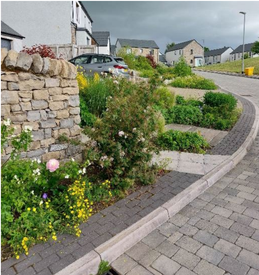
Gardens planted with a variety of plants rather than being turfed offer greater amenity, food for pollinators, and makes the changes in level along the street more attractive. Kirkby Lonsdale.