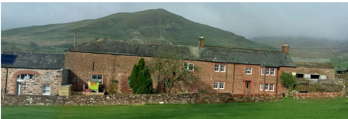
A linear farmstead with farmhouse, barns, stables, outbuildings and cottages. Dufton.