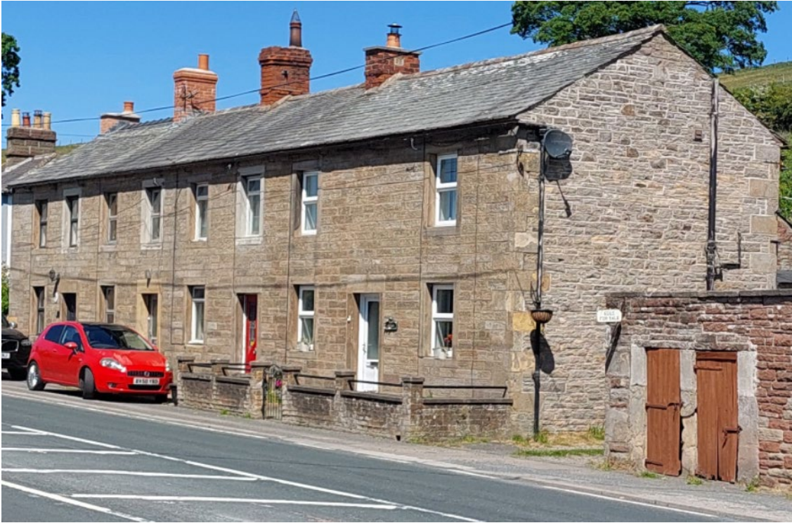
A long or short row of identical or similar houses built for industrial workers. Low Hesket.