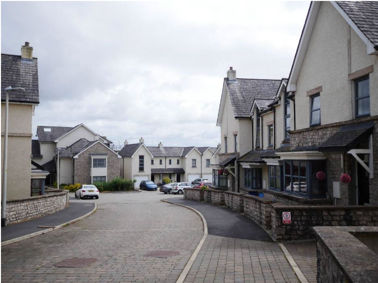
The changes in building height, but also the proportions of features and sloping landform give this street scene plenty of vertical accents. Grange-over-Sands.