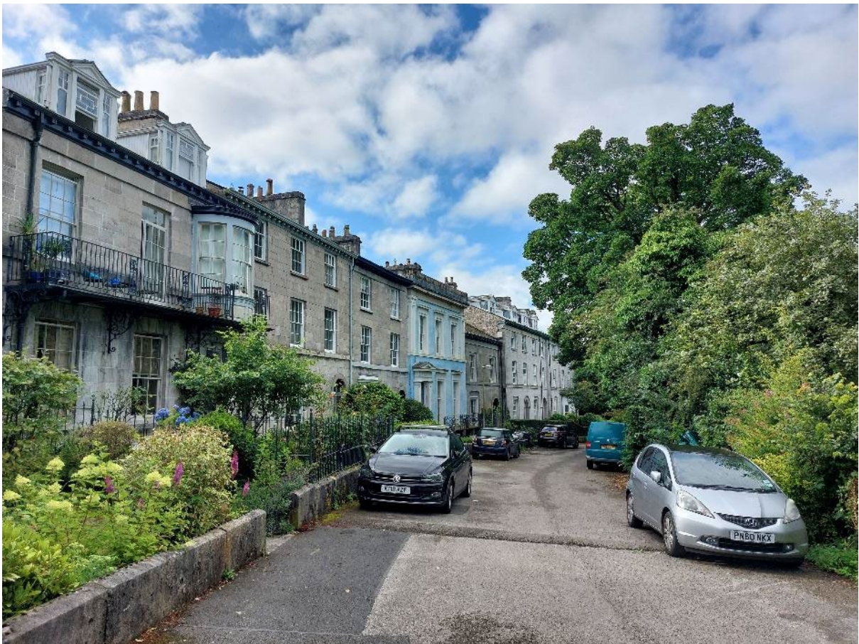
Although this development predates cars, the simplicity of the shared surface and informal provision of parking makes the space very uncluttered. Kendal.