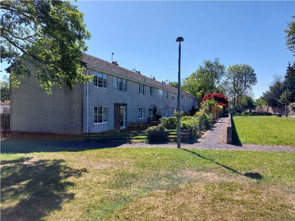
In this estate in Greystoke, footpaths either follow the road or provide shortcuts that are well-overlooked by houses.

CODE OD 4.2c Street Design: Street and movement designs must ensure a permeable and well-connected street network for all users with clear and logical through-routes that are easy to navigate. There will be a presumption of public access into and through developed sites unless there is an overriding justification for the prevention of access.