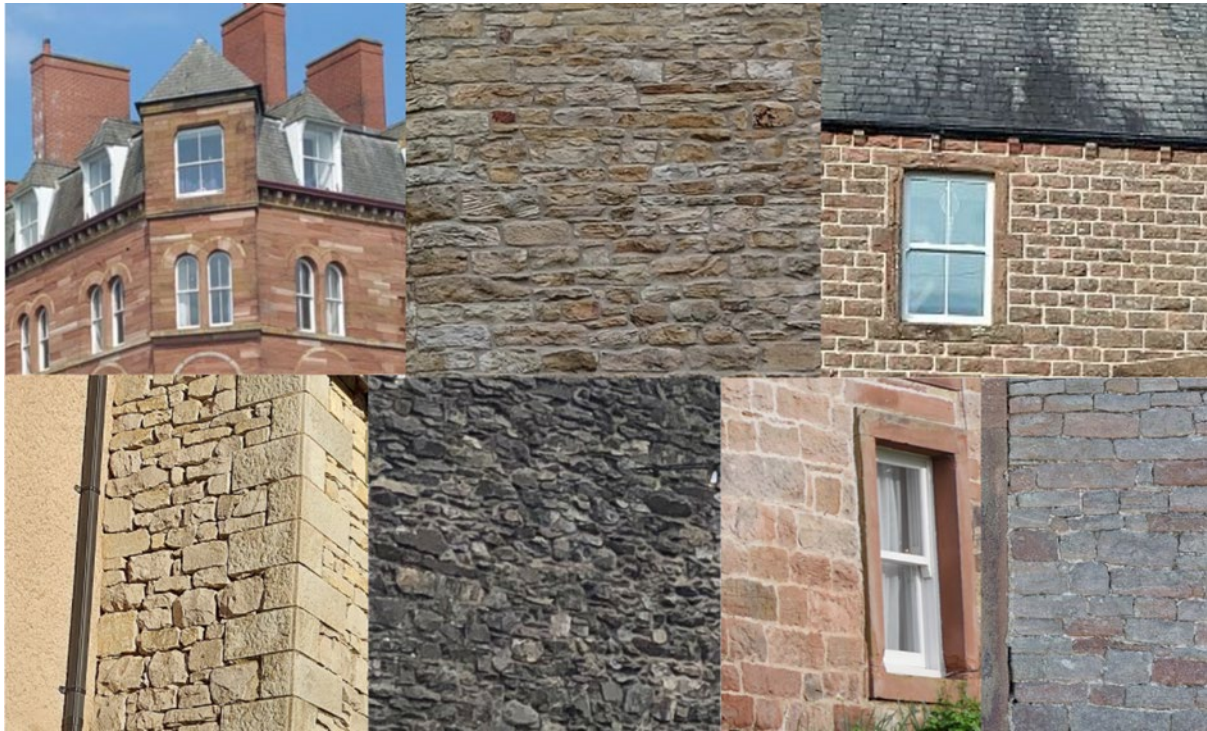
A small sample of the wide variety of building stone found across the district. Clockwise from top left: Barrow, Alston, Dufton, Ivegill, Appleby, Ulverston and Kirkby Lonsdale.