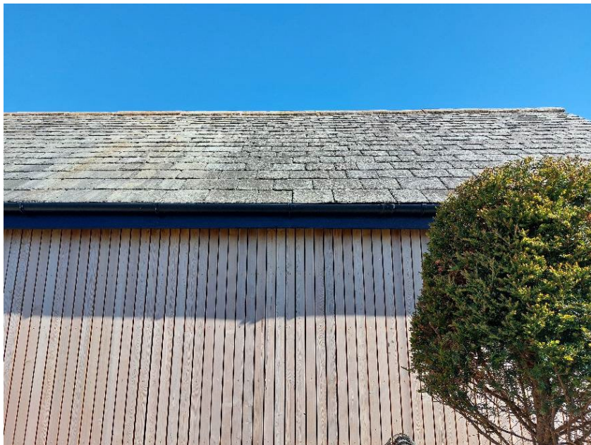
Natural slate and timber have lower embodied energy and can be re-used or recycled. Greystoke.