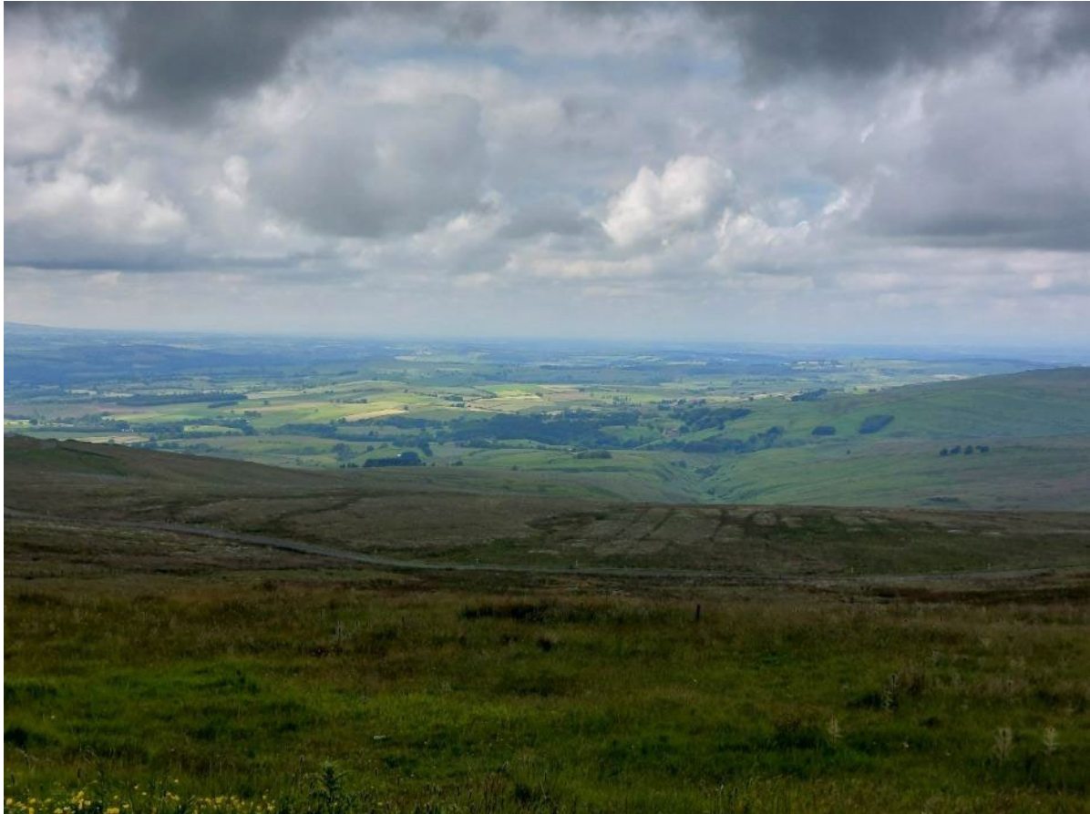
The upland character area of the North Pennines National landscape in the foreground, and the Eden Valley in the distance.

1.9 This design code includes a checklist to help you identify and understand the National Character Areas and Cumbria Landscape Character Types. Further information is also available in the Summary Character Appraisal and Baseline.