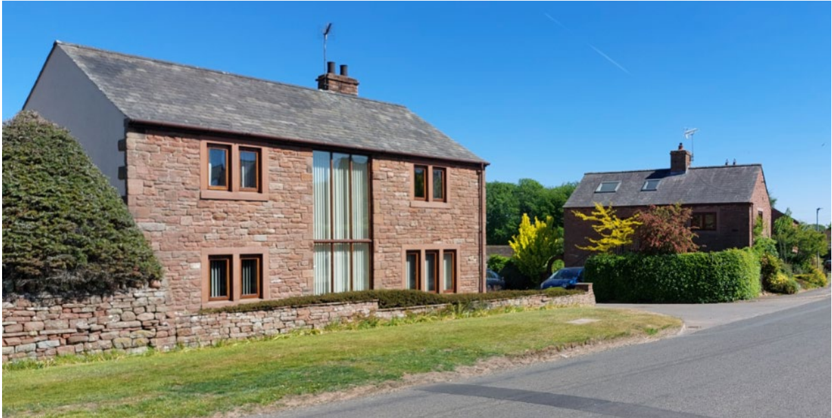
A shared drive that places cars behind the building line and gardens upholds the village character of Great Salkeld.