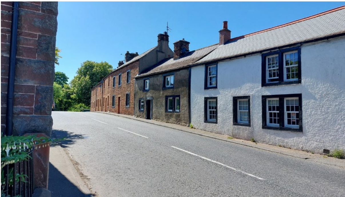
Bare stone, natural colour render and painted render side by side, giving a variety of textures along with the variations in the designs of the houses and cottages. Langwathby.