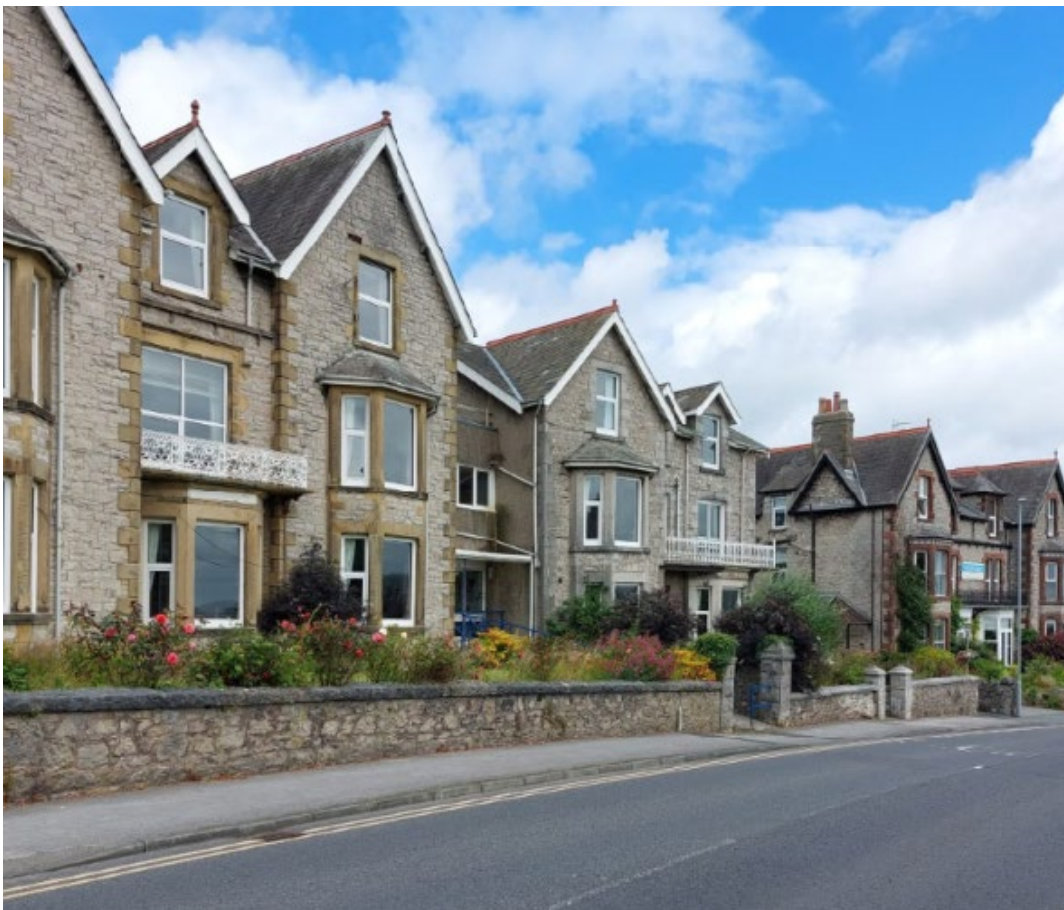
Grange-over-Sands expanded in the 19th century as a seaside resort. This led to impressive villas and boarding houses being built for holidaymakers, giving it a genteel and largely Victorian townscape.