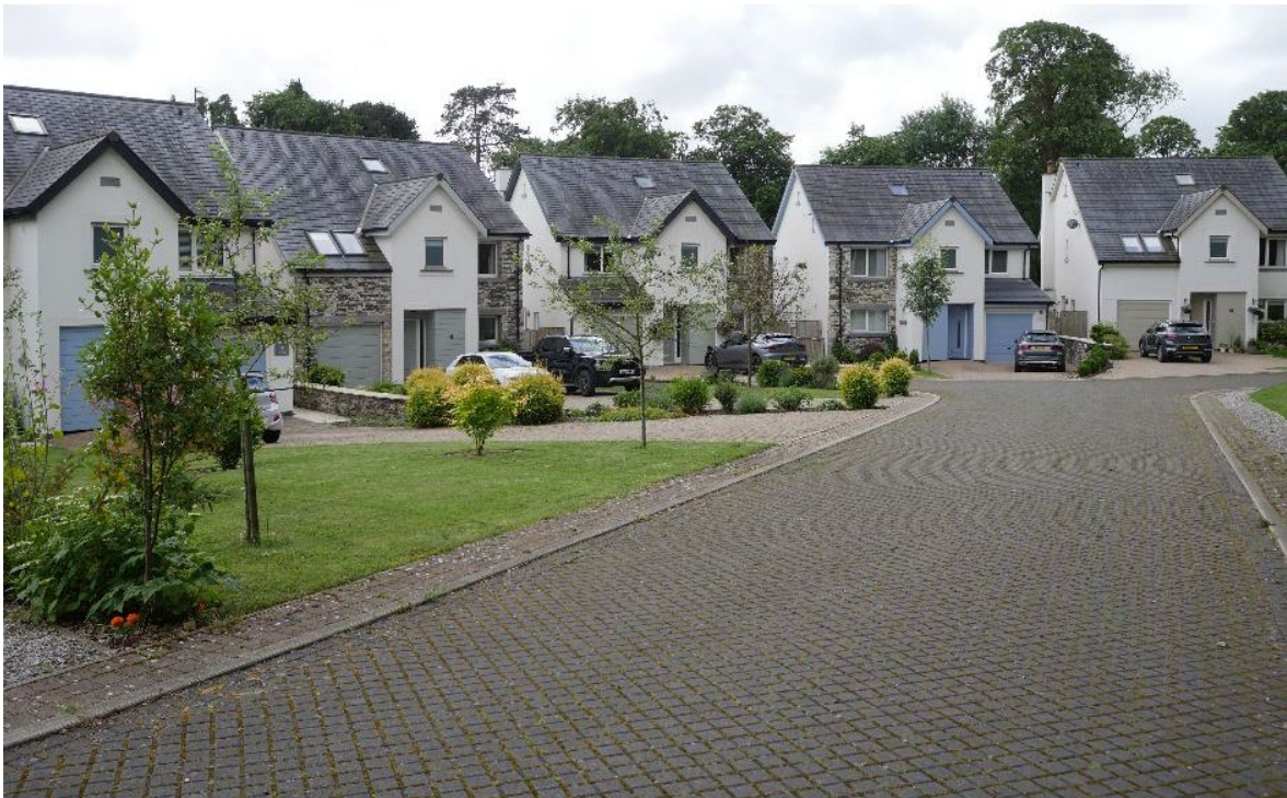
Each house has a driveway to the front, but the longer gardens to the nearest houses screen and reduce the visual impact of parked cars on the street scene. The overall effect is that the gardens dominate the view rather than the drives and cars. Ulverston.

4.34 Electric vehicle charging points should be suitably designed into schemes. The Council's Electric Vehicle Strategy sets out the strategy and practical steps for increasing the provision of EV charging in the district. EV charging provision should be: