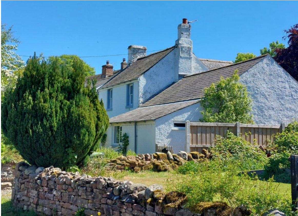
Slate roofs of different pitches and heights give this house a vernacular character, and a sense of being adapted and added to over time by simply building on to the existing structure. Low Hesketh.