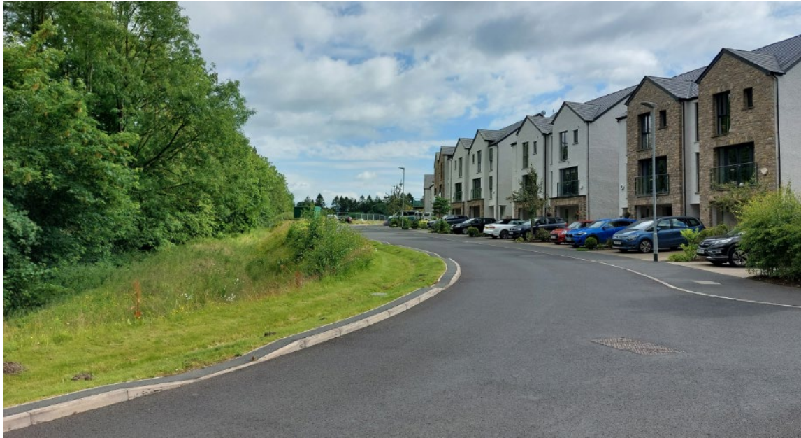
Here in Kirkby Lonsdale, runoff can pass through the dropped kerbs and into a landscaped drainage swale. The swale doubles as amenity landscaping for the buildings opposite.