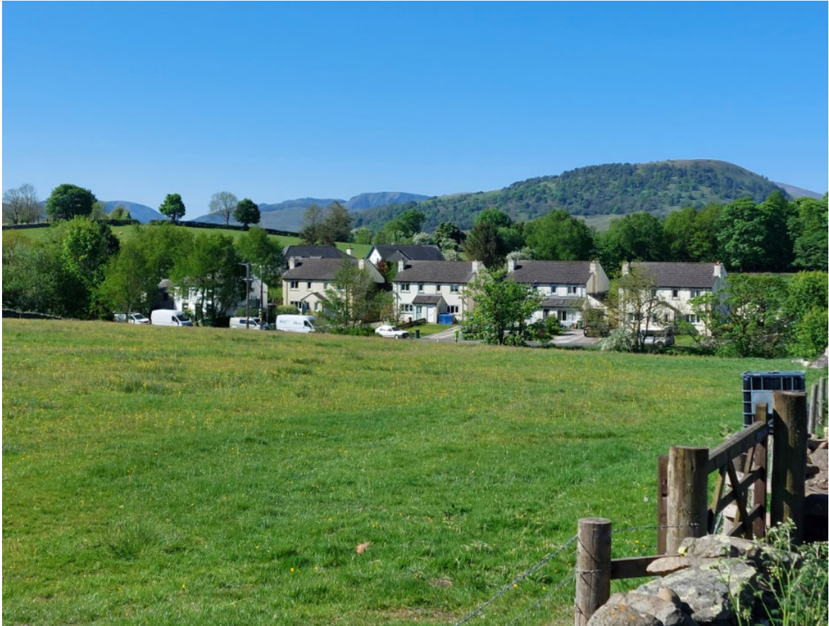
This row of buildings in Motherby has a clear building line. The roof ridges, eaves, and elevations all form a straight line from left to right.