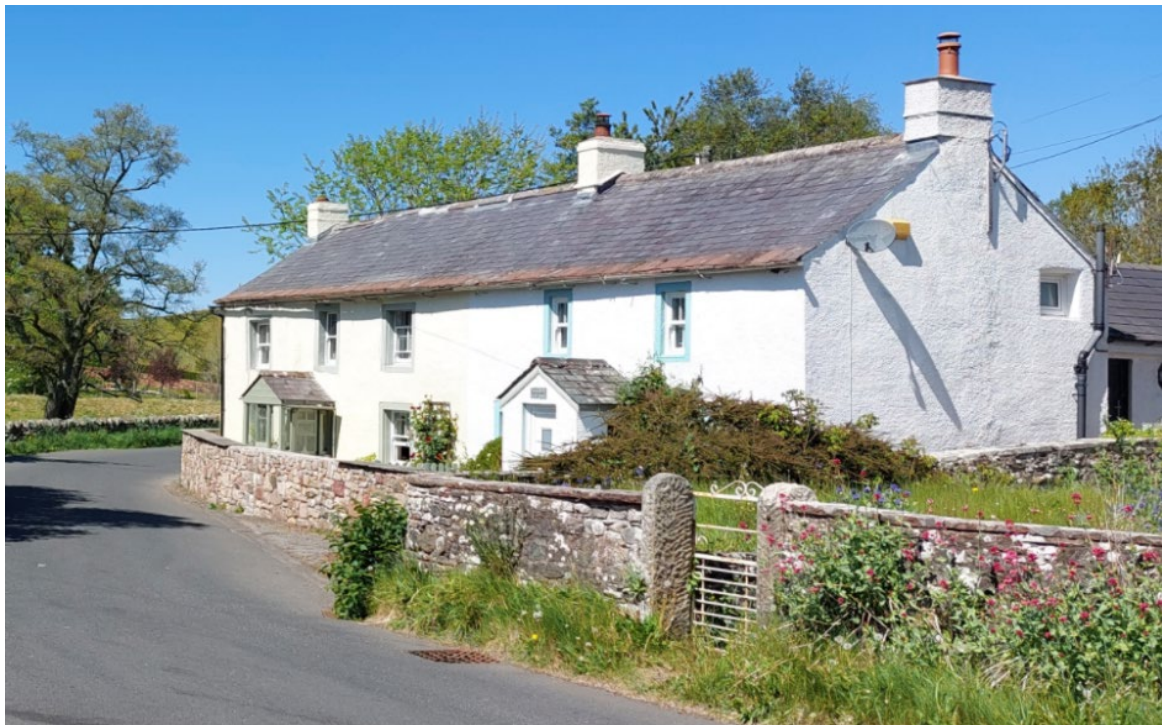
Millhouse borders the Lake District, and this is evident in the Cumbrian blue slate roof with distinctive stone slate lower course and the smaller openings and extra-solid looking walls. These minor variations within the materials and design of buildings across the district must not be lost through the use of generic details or standard materials and details.