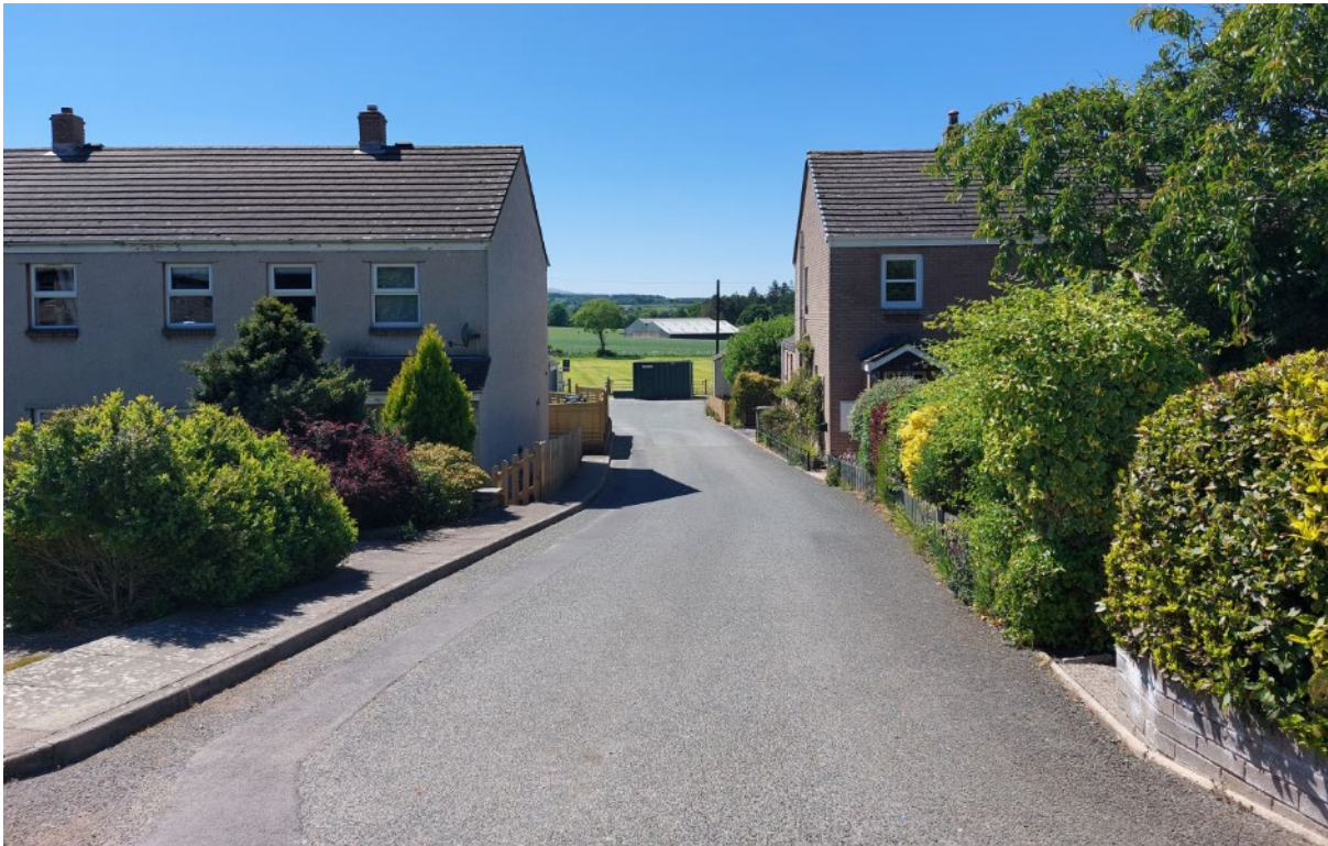
Even the simplest of building designs takes on a new dimension if there are views that reinforce a rural or village character. Low Hesket.

CODE OD 6.5 Historic Design: Where development impacts a conservation area or the historic core of a settlement, design must reflect the local vernacular tradition (where buildings were designed to meet functional needs) or otherwise show a clear response to local context. There are many variations according to location and the applicant must demonstrate that their designs respond appropriately to the specific traditions of the area.