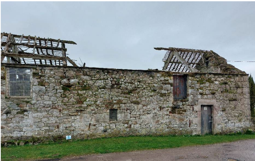
Although derelict, the walls of this barn at Stainton near Penrith are embodied carbon that may be capable of repair, and re-use or as a last resort, a source of recycled materials.