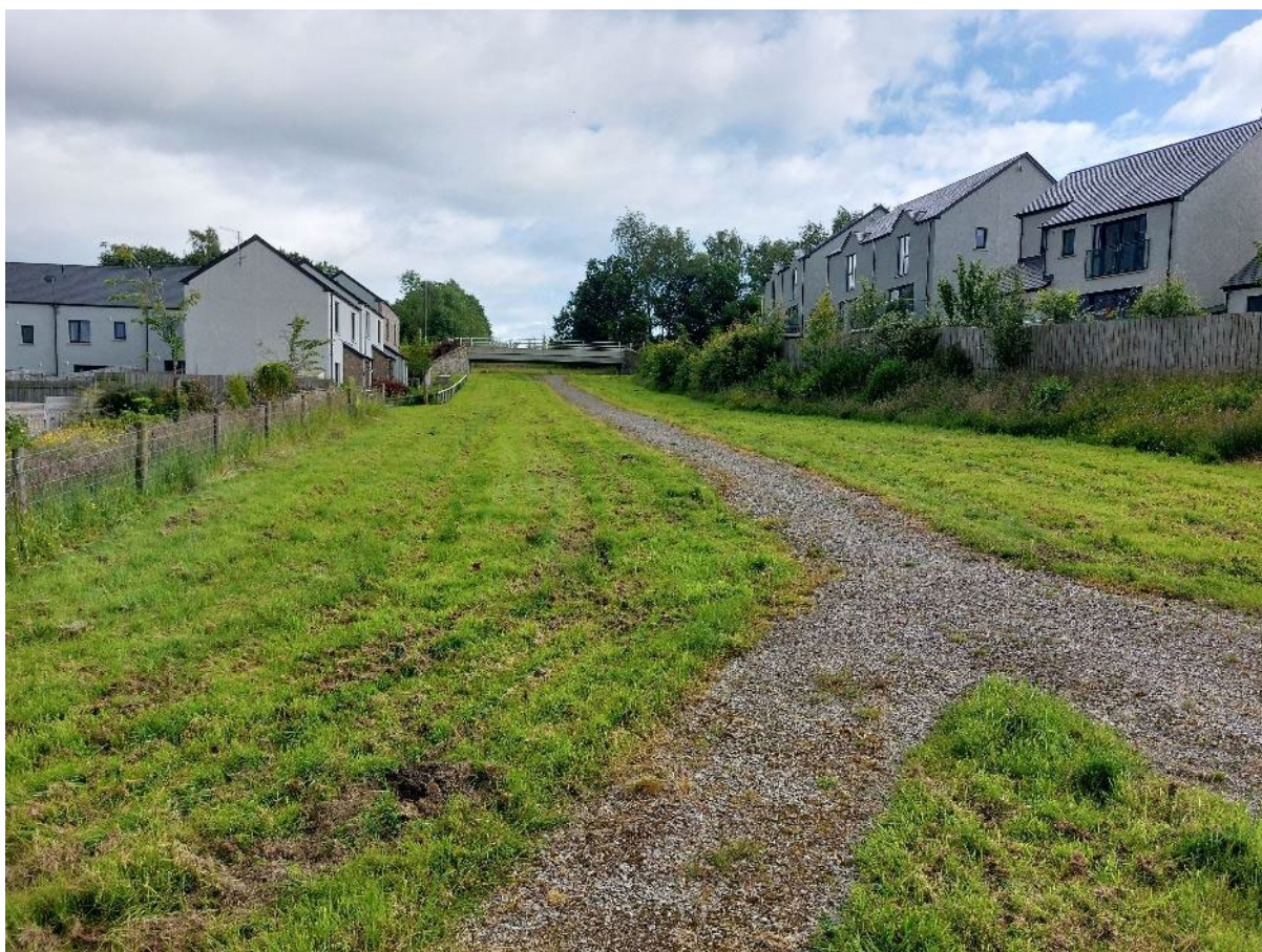
This footpath connects several streets in the site, providing an alternative route to the pavements. Kirkby Lonsdale.