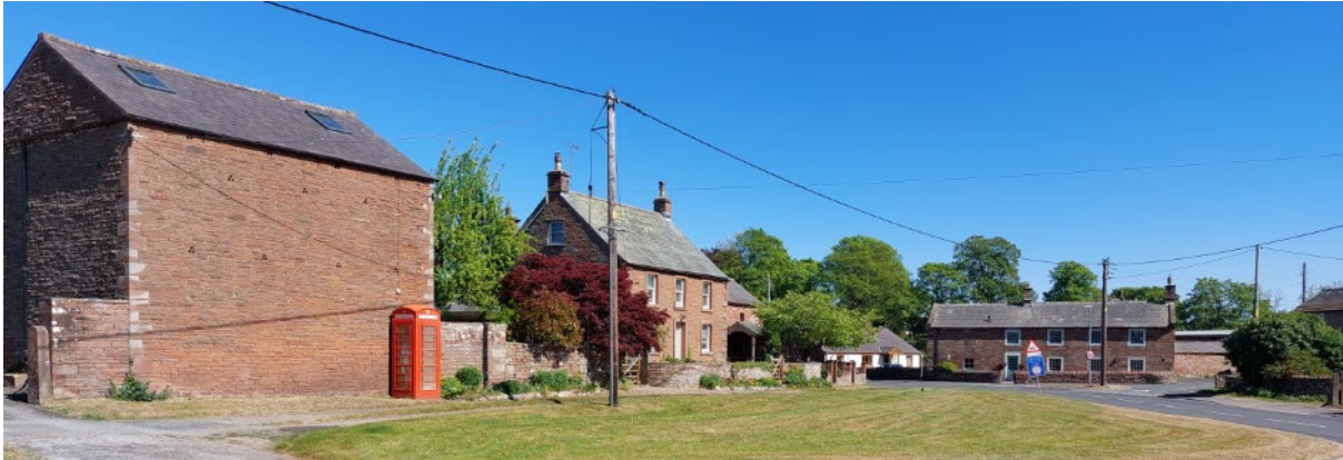
Three very different buildings, but harmony through the use of similar local stone and a mix of local and Welsh slate. Langwathby.