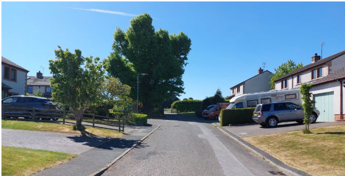
This street is a cul-de-sac for motor vehicles, but a through route for pedestrians and cyclists via the opening between the large tree and hedge. This provides an alternative to following the highway network. Great Salkeld.