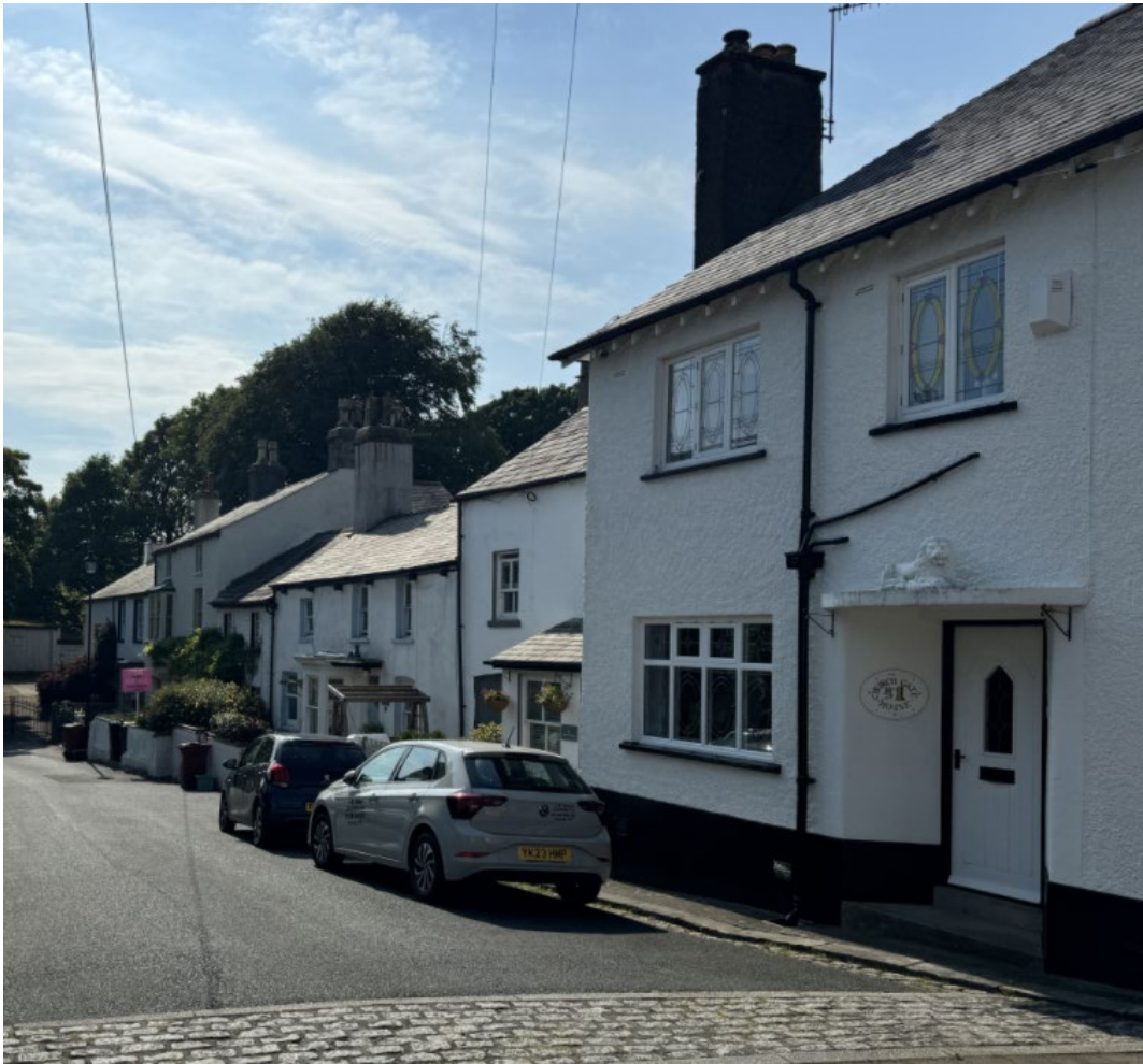
A row of attached buildings in Dalton that has developed or changed over a long time, and contain a mix of building sizes, heights, styles, set back distances, materials, forms, uses and proportions.