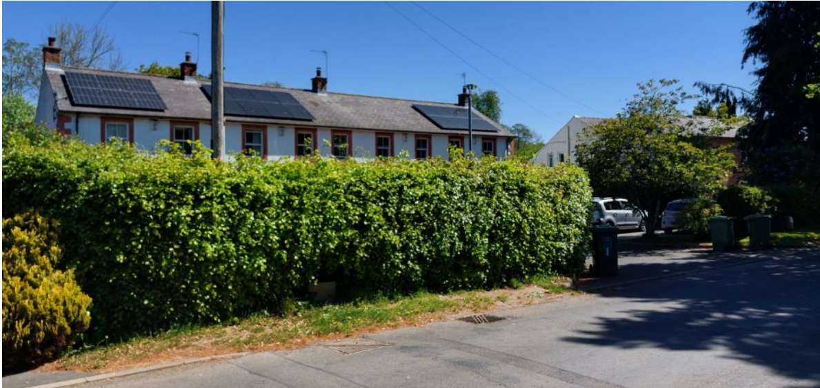
A single drive leading to each house's parking spaces means that the street is fronted by a hedge rather than a row of parked cars. Newton Reigny.