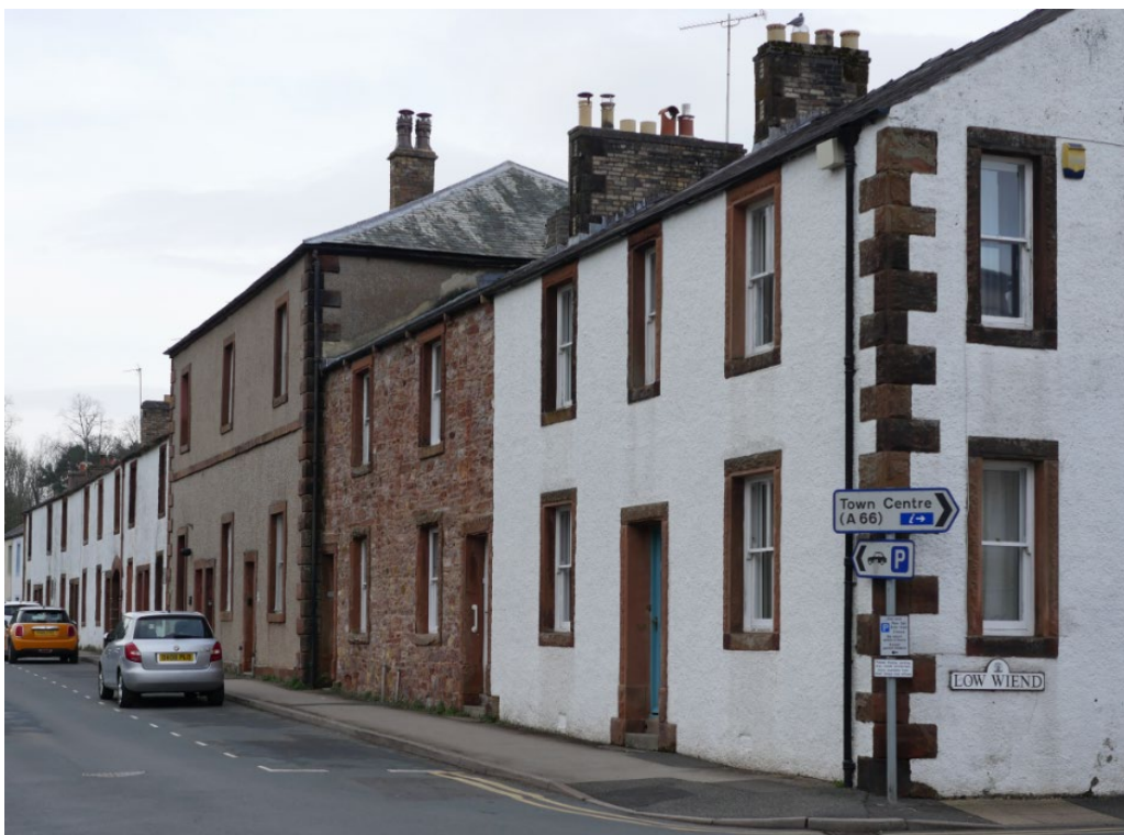
A composed street frontage and doorways and windows facing directly onto the street. Appleby.