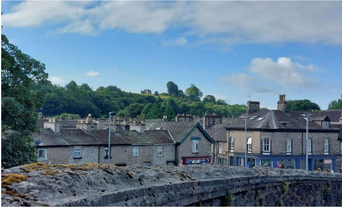
Uniform roof heights in Kendal but made more lively by the vertical accents of the chimneys and the slightly taller corner buildings containing shops. Views of the wooded backdrop and castle provide added interest.