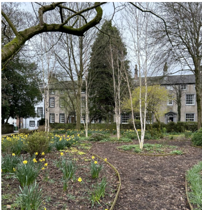
Smaller spaces such as this one in Penrith can offer seasonal variety and interest within the built-up area.