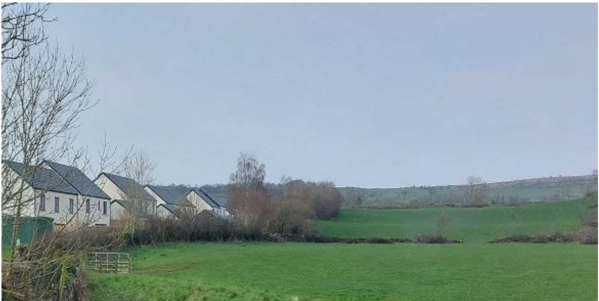
The retained hedgerow and tree line soften the edge of this development where it adjoins the countryside – even when the hedges and trees are not in leaf. Kendal.