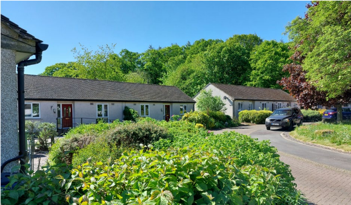
This low-level planting provides different species and habitats to the woodland in the background. Visually however, the leafy planting extends the setting into the site and therefore integrates the development with its context. Greystoke.