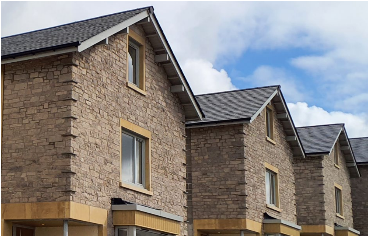
A range of projecting and recessed features – both large and small – add interest and character to this new development in Lindal-in-Furness.