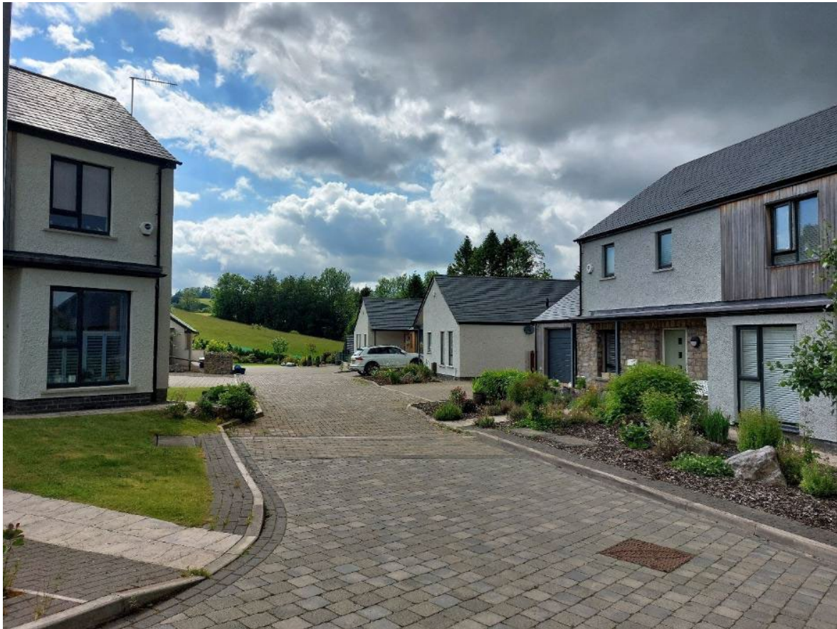
Views out to the countryside, or landscape enhance the design and character of any development. These views provide a crucial link to place and context and add a different dimension to the street scene. Kirkby Lonsdale.